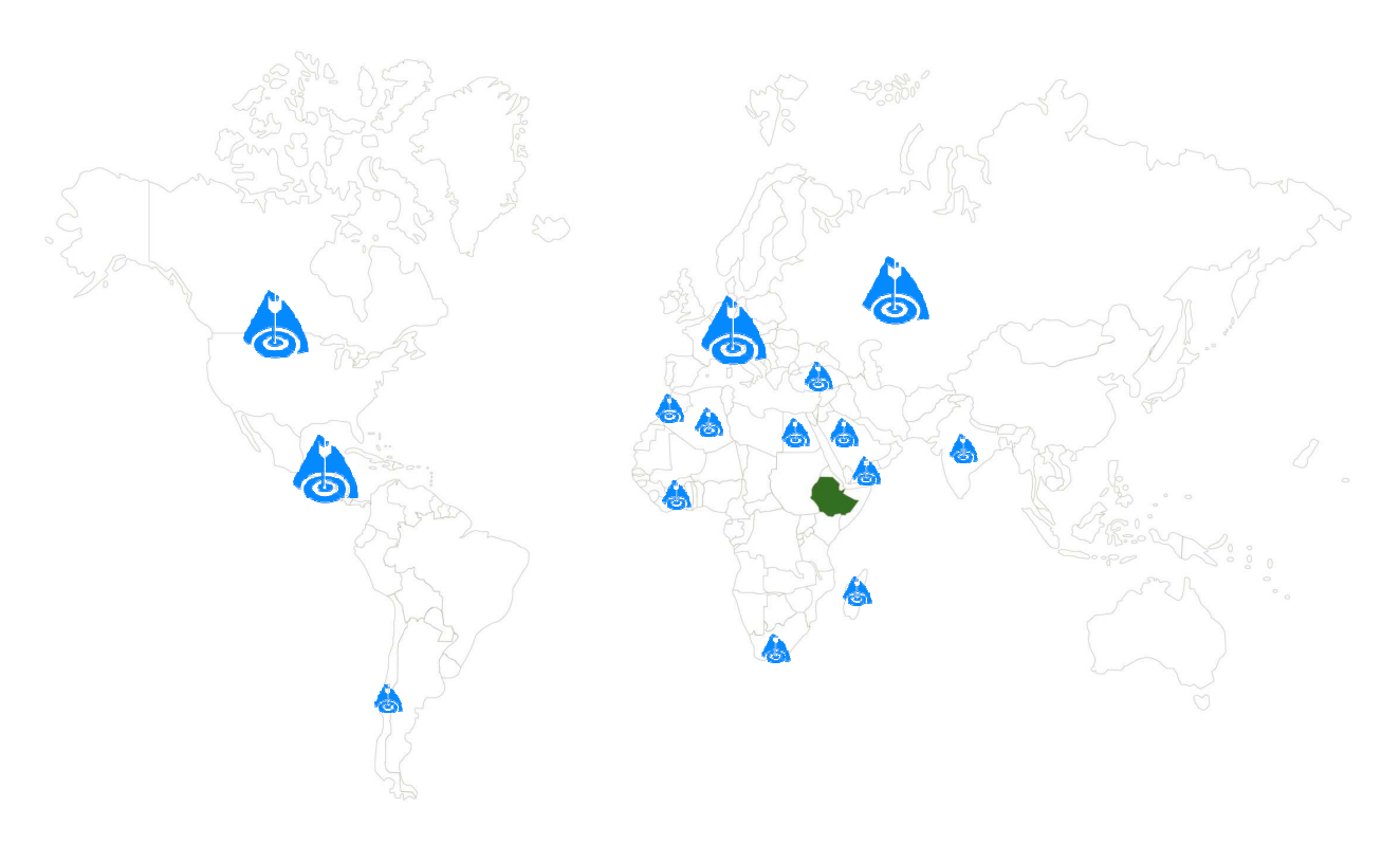
Exports: 30,000 tons annual production

Currently, Navy export market from Ethiopia exceeds 50,000Mt per annum of which 30,000Mt are sold by Acos.